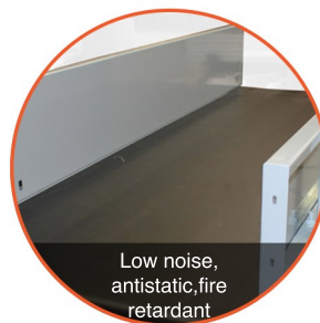
Low noise, antistatic, fire retardant