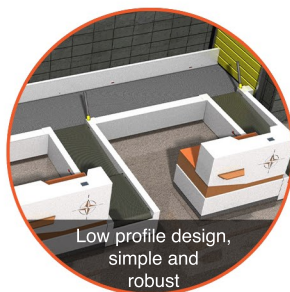
Low profile design, simple and robust