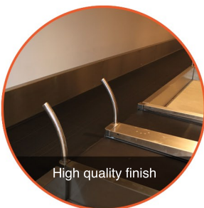
High quality finish