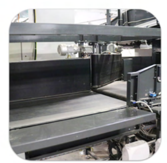
Available in a wide variety of layouts