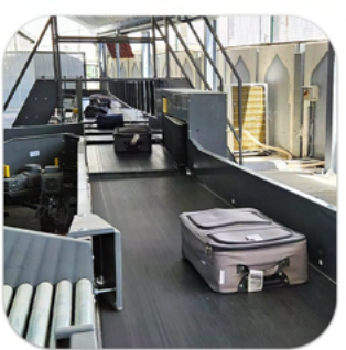
High capacity transport