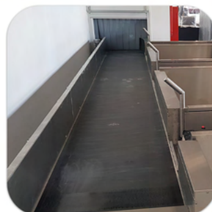
Easy access for maintenance procedures