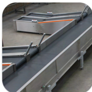
Low gap between conveyors eliminating the risk for the baggage to get stuck in transition