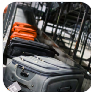
High capacity transport