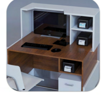
Dedicated areas for equipment (label printers, monitors, computers, documents)