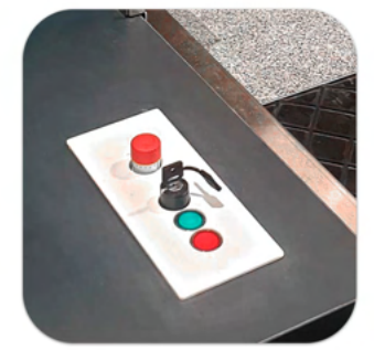
Wide variety of design available