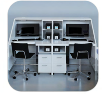
Ergonomic design for Passengers and Operators