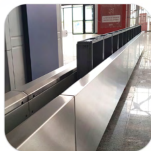
Available in a wide variety of lengths