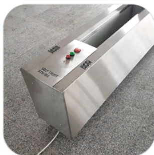
High capacity transport