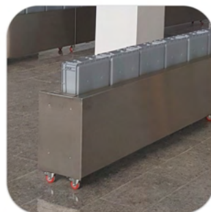
Low power consumption